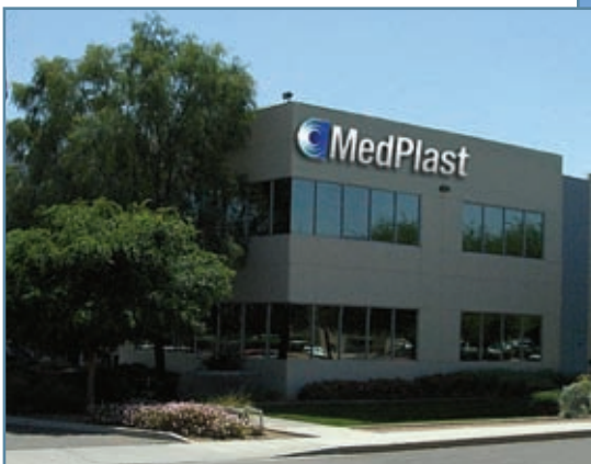
MedPlast's corporate headquarters are located at this facility in Tempe, AZ, purchased from ATP in April 2008.